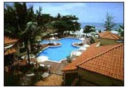
14/7 Moo 2, Chaweng Beach, Koh Samui, Surat Thani

Located at the heart of the famed Chaweng Beach, the charm of its seaboard low rise architectural style emphasizing simplicity and comfort through the intricate combination of metal and wood allows it to blend with the landscape.