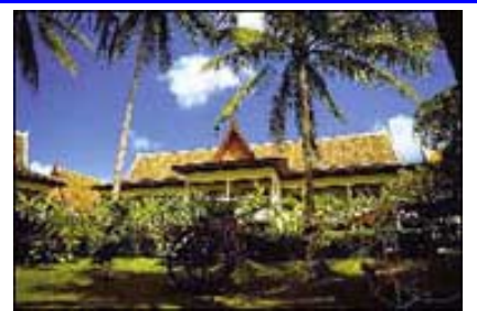
99 Moo 2, T. Bophut, Koh Samui

Come to the Blue Lagoon Hotel for the holiday of a lifetime. Situated at pristine white sandy Chaweng beach the Blue Lagoon with all the four star amenities for fun holiday, including a superb seaside restaurant offering the freshest seafood, local or continental cuisine. You will always be welcomed by our friendly, smiling and multilingual staff, who will keep you comfortable and provide