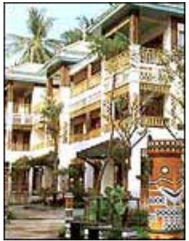
160 Bo Phut, Koh Samui

shopping area and major entertainment, with our 88 comfortable deluxe rooms and 5 suites in a 4 story building classical style.