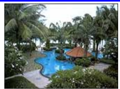
38/2 Bo Phut, Chaweng Beach, Koh Samui, Surat Thani

choice of exceptional dining, recreation and spa facilities, it is the ultimate holiday choice.