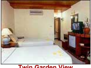
Twin Garden View

All Deluxe Rooms are designed to merge into the natural tropical environment and features include air-conditioning, satellite TV, telephone, refrigerator with mini-bar, hot water and 24 hour room service.