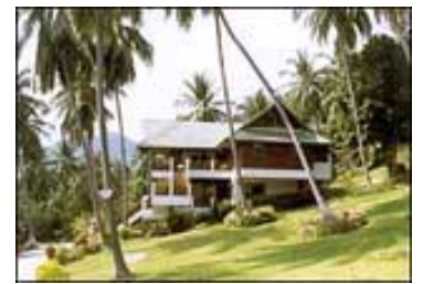
104 Moo3, Bophut, Koh Samui

most spectacular location on the island. Our location between the bustling resort beach of Chaweng and the popular, but quieter Lamai Beach offers ready access to the best of Samui. At the end of a day at the beach, or exploring the island's villages and mountains, our breathtaking mountain-side location makes Samui Bayview the perfect, tranquil retreat.