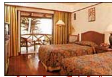
Deluxe Room (Twin Bed)