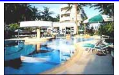
19, Chaweng Beach Road, Koh Samui

Chaba Samui Resort is located in the centre of Chaweng, Samui's best and most popular beach, with a huge choice of restaurants, shopping, nightlife and holiday services right on your doorstep.