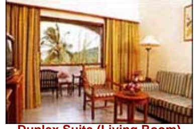
Duplex Suite (Living Room)