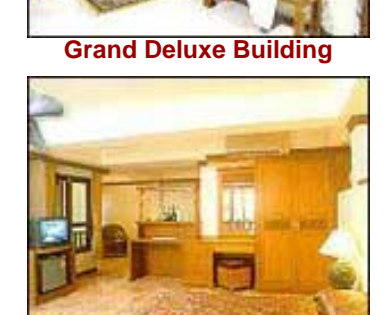
Grand Deluxe Garden

Room facilities : All rooms have color TV, telephone, mini-bar and air-conditioning.