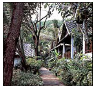
60 Moo 4, Tumbon Pae, Rayong

Located on a tranquil private corner of Ao Prao, western coast of Samed Island, Ao Prao Resort is an ideal hideaway place with lots of enjoyable activities and impressive moment among picturesque scenery of sun set. Quiet and shady corner under lush tropical garden located a few steps from the white sandy beach allows you to have a real rest, after enjoying crystal clear water under the bright blue sky.