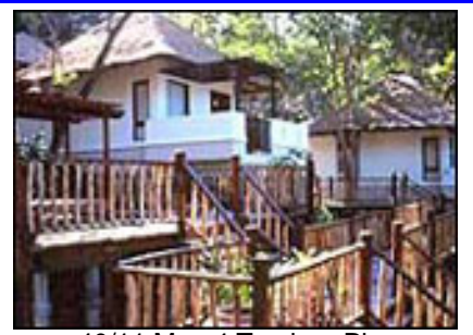
40/11 Moo 4,Tumbon Phe Amphur Mueang Rayong

The only boutique four-star resort of Samed Island, Le Vimarn Cottages on tranquil beach of Ao Prao, can be counted a new alternative for sea lover who prefer enjoying precious holiday in style. Simple but elegant, lovely cottages on stilts with thick thatch roof equipped with modern facilities are ideally designed to be doted around on small slope, hidden among private world of tall tropical trees in front of the tranquil sandy beach of Ao Prao.