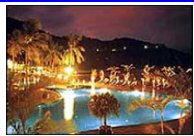
186 Moo 1, Baan Phe, Muang, Rayong

Surroundings Sunbathers can fill their days on our private beach or take our boat service from our private pier to Koh Samet, the exquisite off shore coral island for swimming, diving and sun bathing on beautiful beaches of fine sand. For Golfers, the hotel provides a transfer service to provides a transfer service to nearby international standard golf courses.