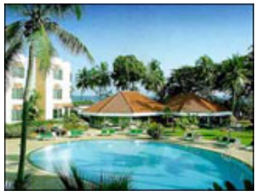
Ban Pae-Mae Pim Road, Rayong

The Palmeraie Beach Hotel is located on a palm-fringed shoreline with clear unpolluted sea. At your feet lie 3 kilometres of clean white sand where beachcombers can take a stroll and pick up a seashell or two.