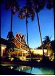
8/5 Karon Noi, Phuket

Welcome to Le Meridien Phuket, Phuket Island, Thailand, is exceptional with its natural beauty and unspoilt charm.