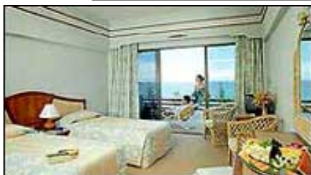
Deluxe Room (Sea view)