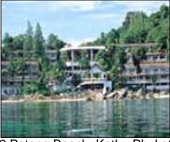
2 Patong Beach, Kathu, Phuket

Known as 'the Pearl of the Andaman Sea' Phuket is located off the southwest coast of Thailand, just 75 minutes by air from Bangkok. On a secluded, picturesque headland in the southern corner of its most popular beach, Patong, sits the Amari Coral Beach Resort.