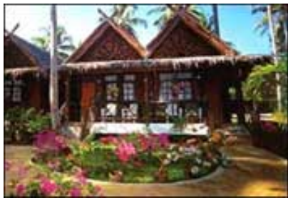
18 Prachanukro Road, Kathu, Phuket

Spread over 36 acres of land, the Duangjitt Resort sits in the only natural setting on Patong Beach. Throughout the complex a variety of flowering plants and colourful trees add to the feeling of paradise. The rooms have been designed in traditional ancient Thai Styles to blend well with the beautiful surroundings.