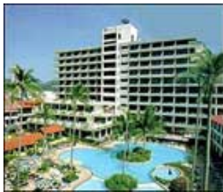
124 Patong Beach, Phuket

Patong Beach Hotel with its superior locate on the beautifully arched Patong Bay, creating a 3 km. fine pearly white sand beach, offers the most stunning view of the setting sun available on the whole island. A variety of water sports and shopping areas are available along this illustrious waterfront to enhance your vacation pleasure.