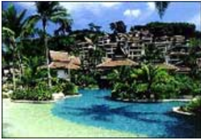
6/2 Nakalay-Patong Beach, Phuket

Traditional Thai architecture blends into a lush, tropical forest. The enticing channels of a seemingly endless pool snake through a green wonderful. Expansive views - tranquil Andaman Sea in front, and the green hills behind - reveal a resort nestled in its own private bay, far from the crowds.