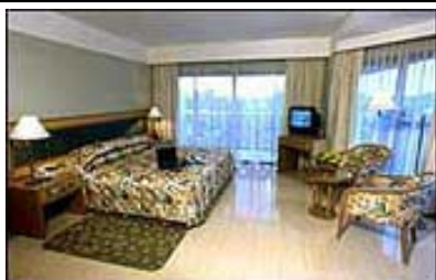
Andaman Room with Balcony