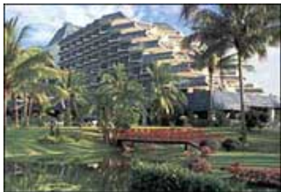
2 Patong Beach, Kathu, Phuket

The hotel is surrounded by 15 acres of landscaped tropical gardens where you and your family can use the day away, unwinding, relaxing and sunbathing in luxuriant tropical environment.