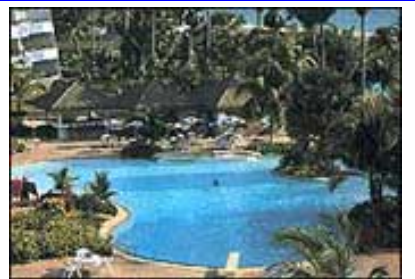
123/10 Karon Beach, Phuket

For Thavorn Plam Beach Resort, we are delighted to present you with our new concept of resort living "Bird of Paradise Wing" which has been deliberately created in unique interior design and specially offers a lot more in facilities, in addition to our Standard and Superior Rooms. Please come and experience our "Bird of Paradise Wing" where the real paradise on earth is.