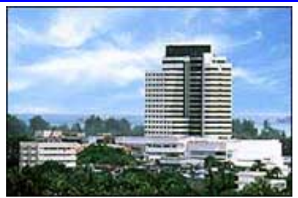
154 Phang-Nga Road, Phuket

From the moment you arrive to the time you check-out you can be assured of the finest quality service and facilities. Royal Phuket City is one of the most established names in international hospitality and our staff look forward to making your stay a comfortable and rewarding experience.