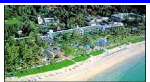
14 Kata Noi Road, Karon, Phuket