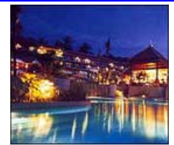
Patak Road, Kata Beach, Phuket

New and state of the art, you find this fine resort hotel set against the beautiful green slopes of the Kata hills. Only 500 meters walking distance to Kata Noi beach, the Andaman Cannacia Resort provides the right backdrop for your Phuket Island holiday.