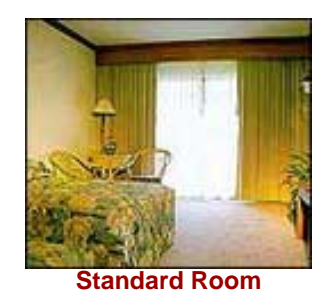
- Private balcony

Rates are quoted in US Dollars and converted into Thai Baht at the Bank Buying Rate of exchange on arrival date unless prepaid.