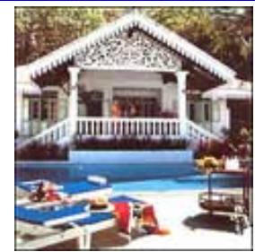
27 Sakdidet Road, Phuket

Cape Panwa Hotel is location at the southern tip of the east coast of Phuket Island, It is built on a hill with a panoramic view of the Andaman Sea. The hotel's beach secluded, free of hawkers and peddlers and protected from the westerly wind which means that the sea is calm and safe for swimming or doing other water sports all year round.