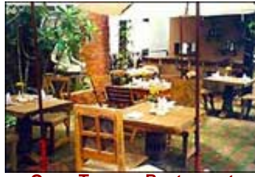
Open Terrace Restaurant