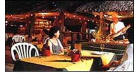
Dining & Entertainment facilities: 1 International restaurant 1 Beach bar