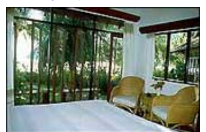
The Princess Junior Suite