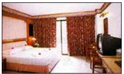
The Main Wing

Rates are nett in Thai Baht, inclusive of American Breakfast, service charge and VAT Pre-booking enquiries or To book a room