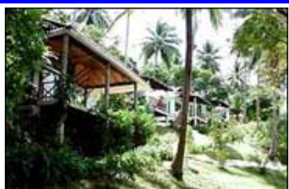
Ao Nang, Krabi

Bay View Resort consists of split- level bungalows. Situated on the hilly terrain of Laem Hin and surrounded by thick groves of trees. From the lodges, you can see the panoramic view of Phi Phi Lae Island. At the Front of the resort lies a pure and white beach.