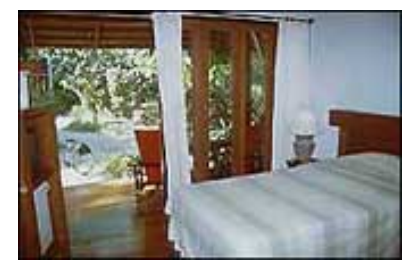
The Beachfront Deluxe Bungalow