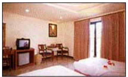
The New Wing