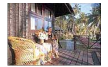
General Facilities: Laundry, Safety Deposit Box, Gift shop, etc. Recreation:

Snorkeling Equipment, Tour Desk, Scuba Diving Center