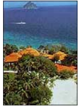
Cape Laemthong, Phi Phi Island

Phi Phi Natural Resort a tropical paradise in Thailand's Andaman Sea, Phi Phi Island one of the most popular destinations in the south of Thailand and is just only 45 kms to the southeast of Phuket and 45 kms to the southwest from Krabi.