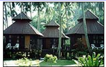
11 Moo 8, Phi Phi Island, Krabi

P.P.CORAL RESORT is located on the Phi Phi Don Island, which is the biggest island among the Phi Phi Islands group. Since the Phi Phi Islands is best known for its wonderful beaches and coral reef, Let's explore and discover the secret wonder of the undersea world here. The coral reefs of the Phi Phi Islands is reckon to be the world's 10 Best".