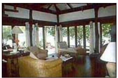
The Princess Royal Suite