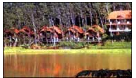
129 Moo5 Bangwan, Kuraburi, Phang-Nga

Kuraburi Greenview Resort welcomes you to the ultimate in nature getaways. Our warm welcome starts at the door, which is a one hundred-year-old woodcarving of the God of Happiness. Settle into our comfortably furnished accommodations and enjoy the peaceful surroundings of this picturesque spot. Relax at your leisure or enjoy the many activities arranged by the hotel.