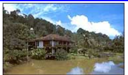
26/8 Moo 7, Tambon Khukkhak, Phang Nga

Khaolak Laguna Resort 80 km away from Phuket International Airport across the bridge to the main land by Phuket-Takuapa Route. In just an hour, you will find the natural beauty of the Andaman sea, the blue sky, the long golden sand beach and cool shade of coconut groves and casuarinas at Khaolak National Park. Located here, in natural tranquil scenery where gracefully architectured and traditional Thai-Style village cottages nestle, is Khaolak Laguna Resort.