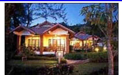
57/7 Moo 4, Bangmung, Phang Nga

Khao Lak Bay Front Resort is situated in the province of Phang Nga in the South of Thailand. Offering great leisure opportunities in a secluded area with a golden beach frontage around scenic mountain backdrop. The Resort is only 1 hour from Phuket Airport.