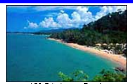
158 Sritakuapa Road, Takuapa, Phang-nga

Khao Lak Resort occupies a land area of some 12 acres, nestled in one of the most private and peaceful spots between the hills of Khaolak and its famous beaches. An outstanding feature of this "Paradise within a paradise" is its situation on gently sloping grounds that rolls right out to the beachfront, Most of bungalows are built on the edge of the resort's 400 metres length private beach, enabling our guests to conveniently stroll along the soft golden sand or go for a dip in the clear blue waters of the Andaman Sea.