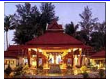
45 Moo 2 Khao Lak, Phang-nga

Pakarang Resort is your tropical heaven. Nestled below verdant peak on a private pristine beach, there is nothing to disturb your tranquility but the cool ocean breezes sweeping through the palms or the small waves breaking on the pearl white sands. The ambience is all tropical Thai beginning with the accommodation provided the renowned Siamese smile. It will be an experience you will dream of repeating time and again.