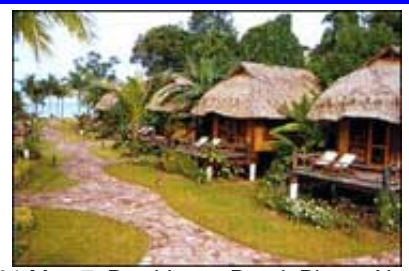
31 Moo 7, Petchksem Road, Phang-Nga

Bangsak Beach Resort brings you closer to the enchanting nature. All 39 cottages are built under the shade of native trees with a private balcony commanding majestic scenery in every unit.