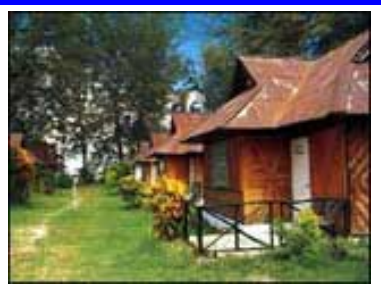
10 Tambon Saladan, Ko Lanta, Krabi

Lanta Island Resort is located on one of the most beautiful beaches on Lanta Island. The unspoiled nature of Southern Thailand truly awaits you at this tropical island paradise. The 99 bungalows of the Lanta Island Resort covers are area of 15 rai (almost 6 acres). The southern style bungalows are tastefully furnished with private balconies and breathtaking views of the Andaman sea. For you adventurous, excursions to nearby islands such as P.P., Hai, Rok, Muk, Ma and Morakot cave can be easily arranged.