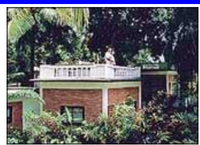
98 Tambon Nongthalay, Krabi

Nestled in Tropical gardens of idyllic Hat Klong Muang Beach, directly on the sea. The Andaman Holiday Resort is the perfect location for those wishing to enjoy peaceful getaway from ordinary concerns of everyday life. Surrounded with a luxurious tropical garden, the resort is located on a hillside with an exceptional overview on the Andaman Sea and its offshore island