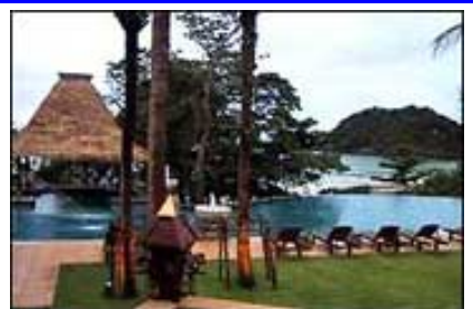
99 Ba Kan Tiang Beach, Lanta Yai Island

The Pimalai Resort and Spa is an elegant boutique resort on untouched Lanta Island in the Andaman Sea, Southern Thailand.