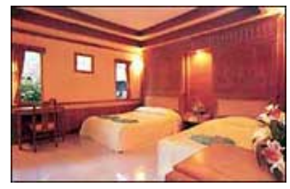
We offer a choice of superior design bungalows with air-conditioned or fan double or twin beds and bathroom with hot and cool shower. (Only Deluxe Air-con bungalow have hot shower)