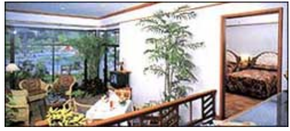
Rates are nett in Thai Baht, inclusive of service charge and VAT Pre-booking enquiries or To book a room