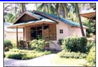
236 Moo 2, Ao-Nang, Krabi

Railay Village Resort is located at railay beach. Our bungalows are close to the beach surrounded by limestone cliffs, accessible only by boat, golden sands, crystal clear water, sheer cliffs and tropical jungle covered hills, with individual bungalows set amid coconut groves and exotic garden.