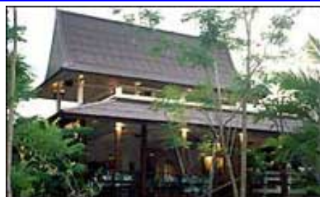
83/158 Soi Talay 12, Takiab Road

Imagine yourself at the white glittering sand beach along the emerald blue sea. Look up above the sky, see the doves flying through the soft cloud. At the horizon, stand the beautiful mountains. This is the destination of your pleasant mind. Hua-Hin Beach... the beach with a renowned legend. Let your mind pursuit the journey amid the calm greenery surroundings and natural sensation. Let it explore and feel the meaning of serenity in the heart of nature. And let this be your destination. Here...at Baan Duangkaew Hua-Hin