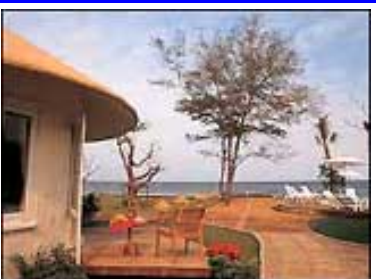
122/ 43-57 Takiab Road, Hua Hin

Kaban Tamor was the original name for Hua Hin, meaning Stone Head. The Kaban Tamor Resort offers 23 Mediterranean style chalets set in the beautiful tranquil bay of Khao Takiab just on the outskirts of Hua Hin.