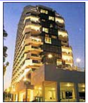
37-38 Banhuadon, Nongkae -Takiab, Hua Hin

Hua Hin Bluewave Beach Resort is located on the scenic Takiab Beach. All of the guest rooms and suites have private terrace with spectacular views of the Gulf of Thailand. 6 Kilometers away is the bustling town of Hua Hin with its popular night market, prized seafood restaurants and varied entertainment to suit all tastes.