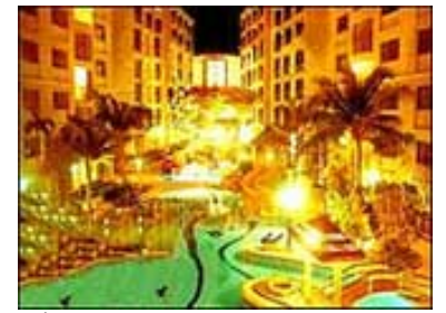
41/48 Phetchkasem Road, Hua-Hin Prachuap Kirikhan

Hin Nam Sai Suay, The Natural Club is a brand new luxury hotel ideally suited for your holiday or recreational needs. Located in Hua Hin on the Gulf of Siam, our facilities also may accommodate conventions and parties. A lush garden, pools and fountains provide the perfect place for young and old to enjoy their time in the Kingdom of Thailand.