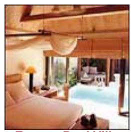
Evason Pool Villa

Guest rooms and suites feature a fresh and unconventional design which is an entirely new concept for Hua Hin. Most rooms have open-style bathrooms which create more space and lightness in the room. A totally new approach to materials, finishes and colours contribute to a refreshing holiday experience.