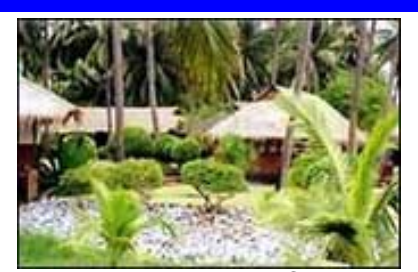
278 Moo 3 Thong Chai Bansapan, Prachuapkhirikan

Suan Ban Krut Beach Resort, The ideal place where you can relax with panoramic, coconutsurrounding view which mixes harmoniously with nature. The rooms, we'd like to invite you to stay in friendly room rate