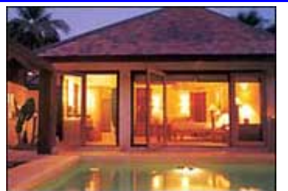
9 Parknampran Beach Hua hin

The Evason Hua Hin Resort and Spa is located at Pranburi approximately 30 kilometres south of Hua Hin town and 230 kilometres from Bangkok. It is set amongst 20 acres of beautifully landscaped tropical gardens filled with lotus ponds and waterways, facing the Gulf of Siam. Travelling time by car from Hua Hin town or airport is 30 minutes, from Bangkok approximately 3 hours.