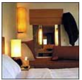
Evason Deluxe Studio