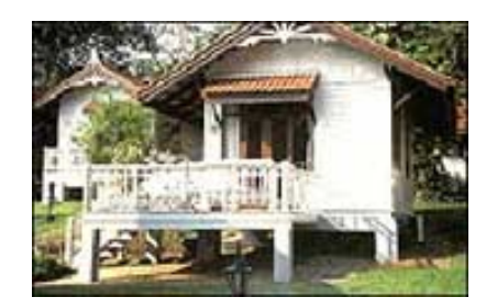
41 one and two-bedroom bungalows are spread throughout the tropical gardens. Every bungalow has its own raised terrace that leads you to the beach.