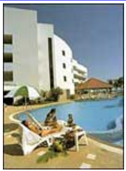
11-66 Liabwangkaikangwon Road, Hua Hin, Prachuap Khiri Khan

Majestic Beach Resort is a first class hotel preserving Hua Hin's ideal resort atmosphere with 45 regular deluxe guestrooms and five different suite types, all beautifully decorated and equipped with modern facilities to ensure utmost comfort and convenience. The magnificent swimming pool and a beachfront restaurant offers an excellent variety of dining convenience and other entertainment options to make your trip just perfect.