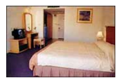
We offer 101 Luxury rooms, 81 Superior rooms, 14 Deluxe rooms, 5 Family Suite rooms and 1 Natural Club Suite room. All rooms are fully and modernly furnished with private balcony.