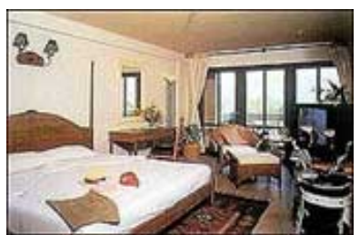
Superior Room (Double)