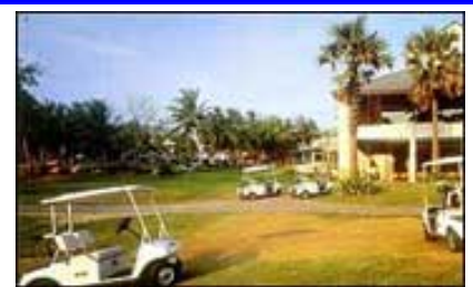
80Hubkapong-Praburi Highway, Cha Am

Just 16 kilometers from the main Petchkasem Road (on Hubkrapong-Pranburi Highway). The Imperial Lake View Hotel & Golf Club is located on the west coast of the Gulf of Siam, approximately 2 hours drive or a 25 minutes flight from Bangkok, and 25 kilometers from Hua Hin (Thailand's oldest major beach resort and golfing area ). The Imperial Lake View Hotel & Golf Club is a fascinating place for a golfing and family vacation.