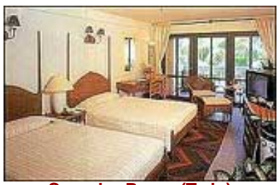
Superior Room (Twin)