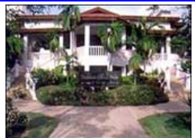
1349 Phetkasem Road, Cha Am

Natural beauty and a classic Thai ambiance are combined at this superior beachfront resort which maintains the aristocratic traditions of what has been Thailand's favorites coastal retreat ever since the 1920s.