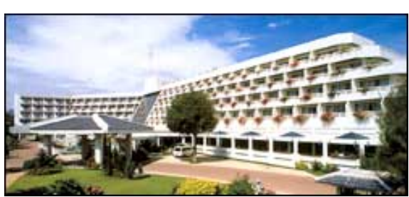
80 Moo 4, Hubkrapong-Praburi, Highway, Cha Am

The unique Methavalai Hotel on the beach outstanding luxurious accommodation superb service and caring hospitality make this the ultimate holiday experience. Your invitation to a breath of fresh air. Come relax - enjoy.