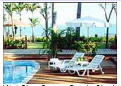
80/1-5 Chao Samran Beach, Cha Am

Rabiang Rua is located directly on the white sandy beach, fronting a long private shoreline on the sunrise side of the Gulf of Thailand. Nestled between slender coconut trees and tropical landscaped garden, the charming seven wooden boat-villas with 8 luxurious rooms which redecorated from Thai style fishing boats are the luxurious and individually clustered around the swimming pool and wooden sundeck in peaceful seclusion.