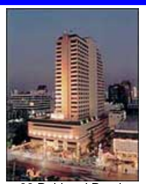
99 Rajdamri Road, Pathumwan,Bangkok

The Arnoma Hotel, Bangkok is in the heart of the city's business and entertainment district. The hotel is situated only a few minutes from the expressway to Bangkok's International Don Muang Airport. It is directly opposite the World Trade Shopping Center with 400 branded retail outlets and five major department stores are within short walking distance. The Thai Handicraft and Culture Center is just next door to the Hotel. The elevated Sky Train Service and the Erawan Shrine are just around the corner