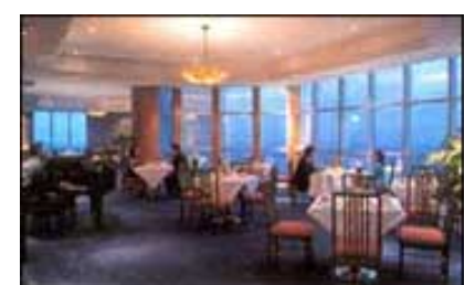
Stella Palace on 79th floor