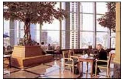
Lobby on 18th floor