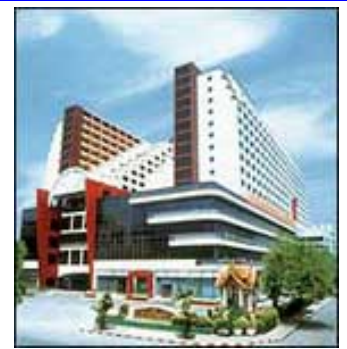
88/2 New Rama 6 Road, Patumwan, Bangkok

Welcome To Sol Twin Towers. The rich culture, vibrant entertainment, fabulous shopping and fast-paced economy draw business and leisure visitors to Bangkok. When visiting Thailand's " City of Angels ", many choose to stay at Sol Twin Towers in the heart of the city's growing commercial district on New Rama VI Road. The city's central railway station is minutes away, and shopping centres, embassies, office buildings and tourist attractions are within easy reach.