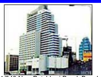
1091/343 New Petchburi Road, Bangkok

All 282 guest rooms and 15 suites are exquisitely adorned to afford the utmost comfort reflecting the richness of Thai culture with first-class room amenities. Facilities include international & traditional Thai restaurants, lounges, recreation facilities, function rooms plus superlative service blended with Thai hospitality.