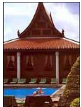
120/126 Rajaprarop Road, Bangkok

We hope that during your visit to Thailand, you will take the opportunity to let us treat you with the gracious Thai hospitality our country is known for.