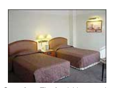
Rates are in U.S. Dollars, exclusive of service charge and VAT Pre-booking enquiries or To book a room