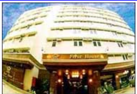
14/20-29 Petchburi 19 Road, Bangkok

Well-situated in Pratunam, one of Bangkok's most city heart, surrounded by the main commercial, shopping and entertainment areas; First House fortunately makes all such attractions and the ambience conveniently accessible.