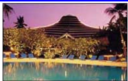
967 Rama I Road, Bangkok

The Siam Inter-Continental Bangkok is a unique Bangkok landmark, located in the heart of the commercial and shopping area, within easy access of the city's Key destinations. It is the only city hotel to offer a lush 26-acre botanical garden - a peaceful heaven in the busy urban centre.