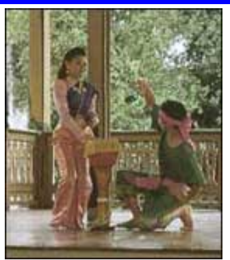
42 Tanee Road, Banglumpoo,Bangkok

The Viengtai takes pride to be one of a few hotels located within the inner city of old Bangkok. This area is conserved for historical purposes known as " Rattanakosin Island " We proudly offer 200 newly renovated nice and comfortable rooms equipped with modern facilities at reasonable prices, including breakfast. You will see more of charm of old Bangkok while relaxing at our hotel.