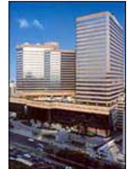
202 Ratchadapisek Road, Huaykwang, Bangkok

The Merchant Court Hotel at Le Concorde, situated on Ratchadaphisek Road, in Bangkok's thriving new business and entertainment district, is just a 10-minute drive away from the city's central business district and major tourist attractions.