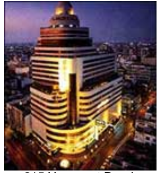
215 Yaowarat Road. Samphantawong, Bangkok

The Grand China Princess, Bangkok is situated in the Grand China Trade Tower, at the intersection of Ratchawong and Yaowarat Roads, right in the midst of the business district of Chinatown with mazes of shops and street vendors. Close to Major sightseeing attractions and Chao Phraya River. 22 Kms to Bangkok International Airport