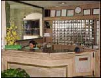
96 Paniang Road, Bangkok

Green Hotel is located near Rajadamneun Avenue, Bangkok which is close to many government agencies, business and shopping centres. Many tourist attractions, such as The Grand Palace, The Chapel Royal of The Emerald Buddha, Vimanmek Mansion and more which are not too far to visit.