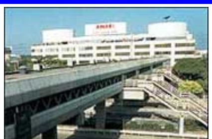
333 Vibhawadee Rangsit Road, Bangkok

For stopovers, transits or the first and last nights of a holiday or business trip, the Amari airport Hotel is ideal. Connected by airbridge to the International Airport, there is also a railway station and expressway right on the doorstep.