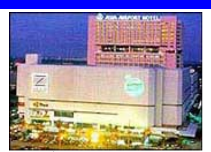
99/2 Phaholyothin Road, Lamlukka Pathumthani

A first class hotel with 550 rooms and suites in Bangkok, the Asia Airport Hotel is ideally located just 3 kilometres from Don Muang International Airport. The hotel offers luxury and convenience all at a great value to the business travelers and tourists.