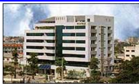
123 Sikan, Donmuang Bangkok

Erawan Airport is an attractive 8-storey residential conveniently located near Bangkok's International Airport. It is now available for rent and energetic city people like you will be making the right choice to move there. With its location being the centre-point to convenient travel facilities, Erawan Airport is ideally situated for those engaged in progressive business ventures.