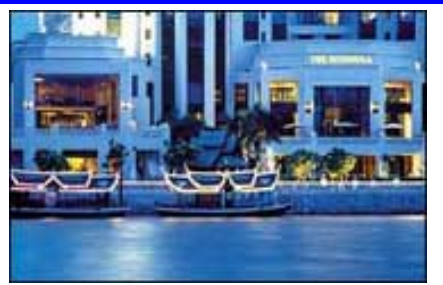
333 Charoennakorn Road, Klongsan,Bangkok

The Peninsula Bangkok is a deluxe hotel situated on the west bank of Chao Phraya River with a spectacular view of Bangkok. The hotel is within easy access to major business districts and shopping areas. Air conditioning, airline desk, bar, business center, ballroom, babysitting service, concierge, conference room, facilities for disabled, florist, gymnasium, laundry service, massage service and ladies hairdresser are among the hotel's amenities and services.