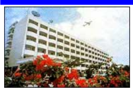
88/100 Vibhawadee Rangsit Road Donmuang, Bangkok

The Comfort Suites Airport, Bangkok (budgeted hotel) with 150 rooms is located 2 kms. from Bangkok International Airport. The hotel provides free transfers to and from the airport for the guests.