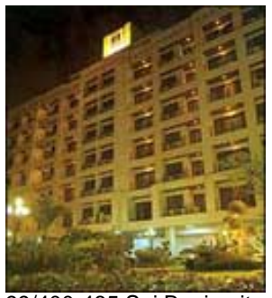
99/400-485 Soi Benjamitr, Chaeng Wanttana Road

We would like to introduce The Quality Suites Airport is elegantly designed all suites room, especially decorated guest room with luxurious one and two bedroom suites each one carefully appointed with large living room, separate bathroom and dining area plus digital safety-box and coffee / tea making Facility.