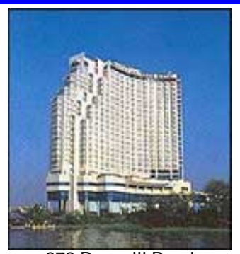
372 Rama III Road Bangkhlo, Bangkok

This 27-storey deluxe hotel offers 462 luxuriously appointed guest rooms and suites, all of which command spectacular views of the Chao Phraya River, "River of Kings." Its excellent facilities and relaxing ambient make the Montien Riverside the discerning traveller's ideal choice whether on business or pleasure.