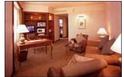
Living Room (Studio)

Merchant Court Hotel at Le Concorde, Bangkok offers quality accommodation, and comprehensive business facilities that meet the expectations of the business traveller.