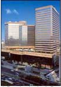
202 Ratchadapisek Road, Huaykwang, Bangkok

The Merchant Court Hotel at Le Concorde, situated on Ratchadapisek Road, in Bangkok's thriving new business and entertainment district, is just a 10-minute drive away from the city's central business district and major tourist attractions.