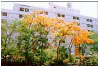
2 Samsen Road, Banglamphu, Ban Pranthom, Bangkok

Welcome to New World Lodge Hotel Our friendly atmosphere is evident the moment you arrive. You will be greeted with a smile and a Sawadee Thai custom for a warm welcome.