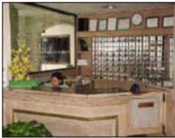
96 Paniang Road, Bangkok

Green Hotel is located near Rajadamneun Avenue, Bangkok which is close to many government agencies, business and shopping centres. Many tourist attractions, such as The Grand Palace, The Chapel Royal of The Emerald Buddha, Vimanmek Mansion and more which are not too far to visit.