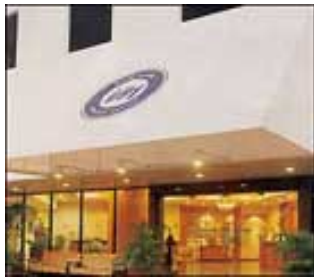
51/3 Ngamwongwan Road Ladyao, Chatuchak

Vibhavadi Mansion is a first class serviced apartment situated on the top floors of the 24 story Vibhavadi Tower. Vibhavadi Mansion is located at the intersection of Vibhavadi-Rangsit Road and Ngamwongwan Road. Its prime location provides easy access to many major roads.