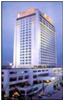
92 Soi Saengcham Rama 9 Road Huay Kwang, Bangkok

Radisson Hotel Bangkok, a Superior First Class Hotel, is located along the Rama IX Road as well as adjacent to the newly built Express Way. Hence, it will take approximately only 30 minutes to get to the Don Muang International Airport and to the major shopping areas. This would be a great advantage for a 1 or 2 nights stopover in Bangkok because less time is spent in the traffic. To make things easier, we provide complimentary scheduled shuttle bus service which runs from the hotel to the wholesale market called Pratunam Market, the Emporium Department Store where you can find all sorts of brand names, the Duty Free Shop which are located at the World Trade Center, the well known night life entertainment area " Patpong - Thaniya " and the Weekend Market which sell everything that you can think of, from household goods to handmade products.