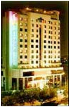
188 Ratchadapisak Road, Huaykwang, Bangkok

Architecture classic in design. Service efficient in caring. At Siam Beverly you step into a magnificent lobby where elegance and friendly Thai greeting set for your entire stay.