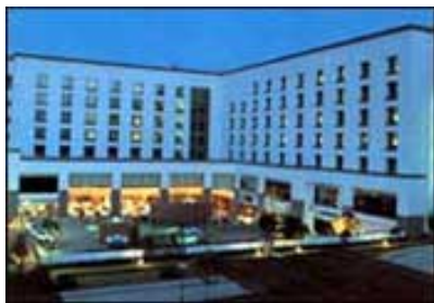
905 Srinakarin Road, Bangkok

Welcome to Royal Princess, Srinakarin-Bangkok A deluxe hotel property is located in the newly developed Bangna area of the Bangkok Metropolis. It's next to Seacon Square, one of Southeast Asia's largest shopping malls. The hotel also provides easy access to industrial and recreational spots in the Eastern region of the country.