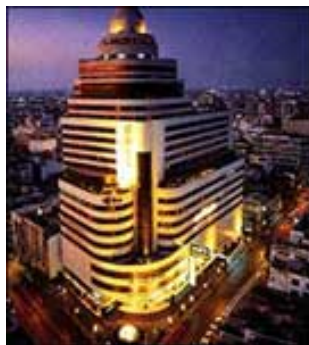
215 Yaowarat Road, Samphantawong, Bangkok

The Grand China Princess, Bangkok is situated in the Grand China Trade Tower, at the intersection of Ratchawong and Yaowarat Roads, right in the midst of the business district of Chinatown with mazes of shops and street vendors. Close to Major sightseeing attractions and Chao Phraya River. 22 Kms to Bangkok International Airport